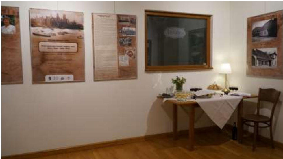
Fig. 3 Exhibit space; the framed green image is a reproduction of the album cover; Refreshments on Opening Day

I'm so happy to be at this ceremony because I'm quite sure that some of you are my cousins – we just don't know it yet.