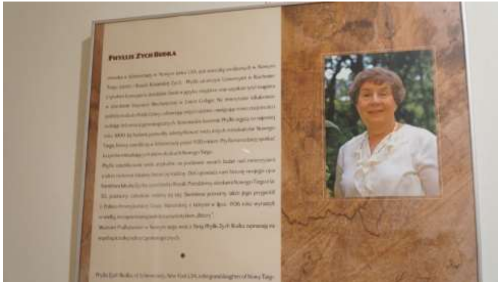
Fig. 4 How nice to be included in the exhibit!