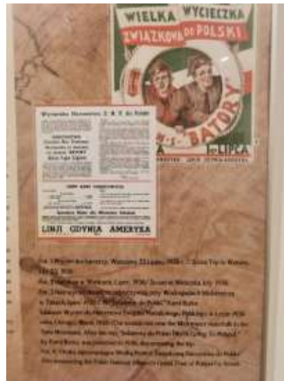
Fig. 5 1936 era recruitment poster.