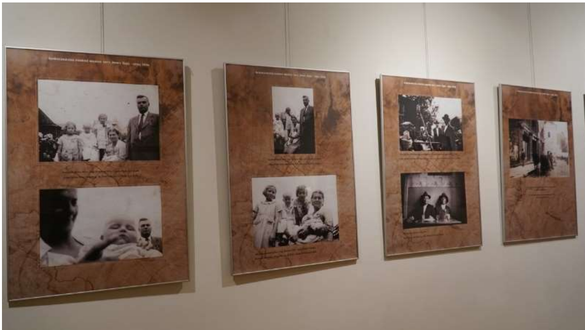
Fig. 8 A variety of pictures