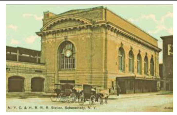
Fig. 4: New York Central-Hudson River Railroad, Schenectady Union Station

http://www.greatamericanstations.com/Stations/SDY