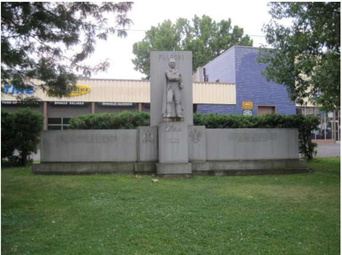
Fig. 1 Monument to Revolutionary War Hero Polish Count Casimir Pulaski, friend of America in the Revolutionary War.

Driving past Pulaski Plaza at the intersection of Nott Terrace with State and Albany Streets in Schenectady, my thoughts do not turn to the military exploits of Revolutionary War hero Kazimierz Pulaski honored in the granite monument (Fig. 1), but rather to a lost era in my own cultural heritage, Schenectady's citizens of Polish descent. The monument, erected in the fall of 1953, was the location of annual October ceremonies honoring this Polish hero who fought for freedom in both Europe and the fledgling America, ceremonies that my family and I participated in as I was growing up.