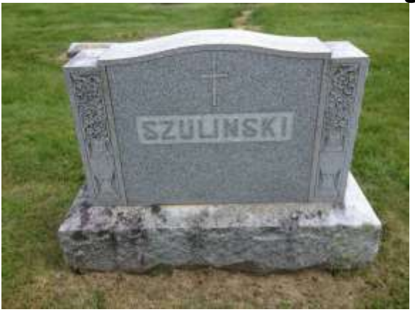
Fig. 2 – St. Mary's Cemetery - The Szulinski family stone